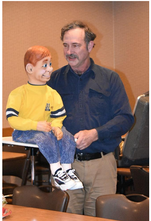
KC9ZXO and his little buddy