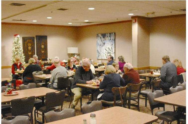
Christmas Party 2018