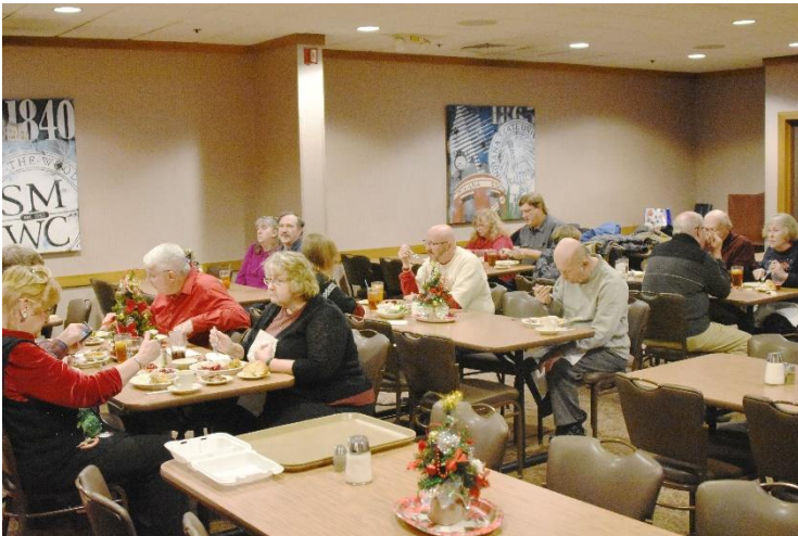
Christmas Party 2018