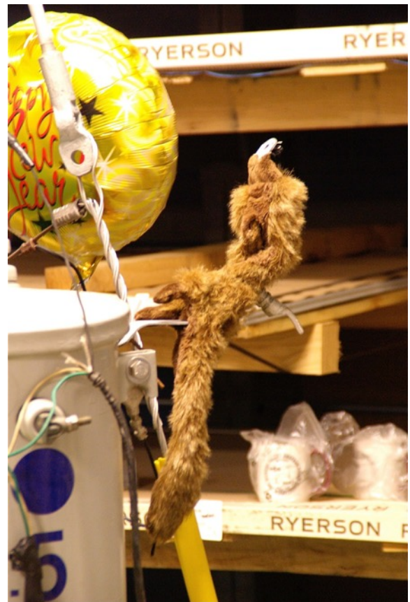
Sure hope that's not Ted's Squirrel