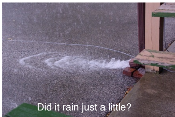
Did it rain just a little?