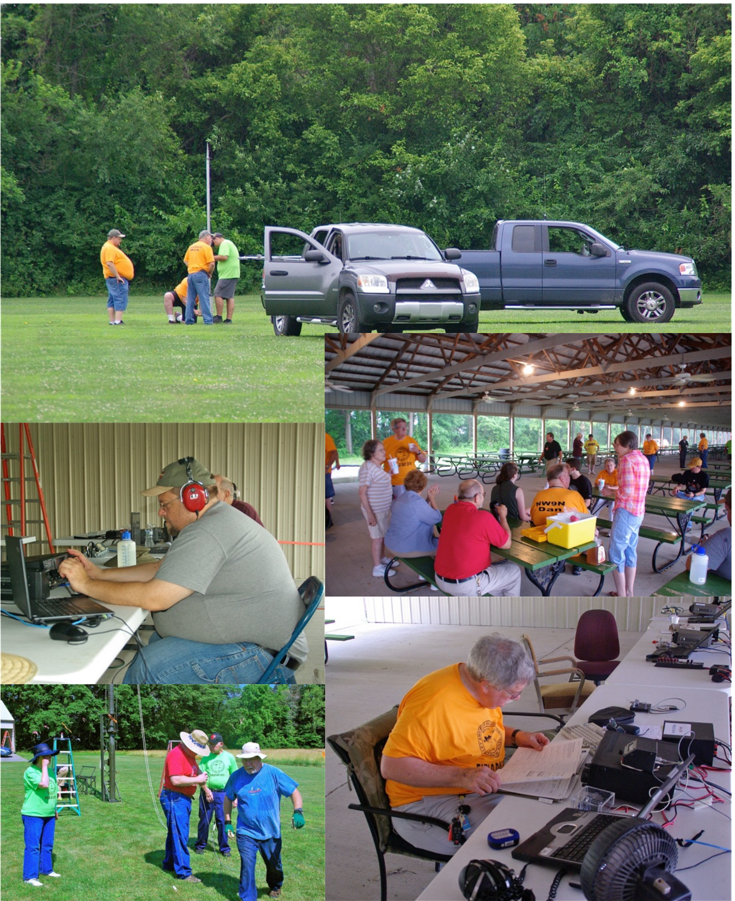
Field Day Pics