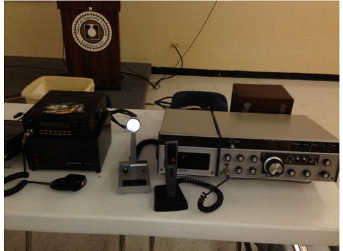
Equipment donated to TH North Radio Club