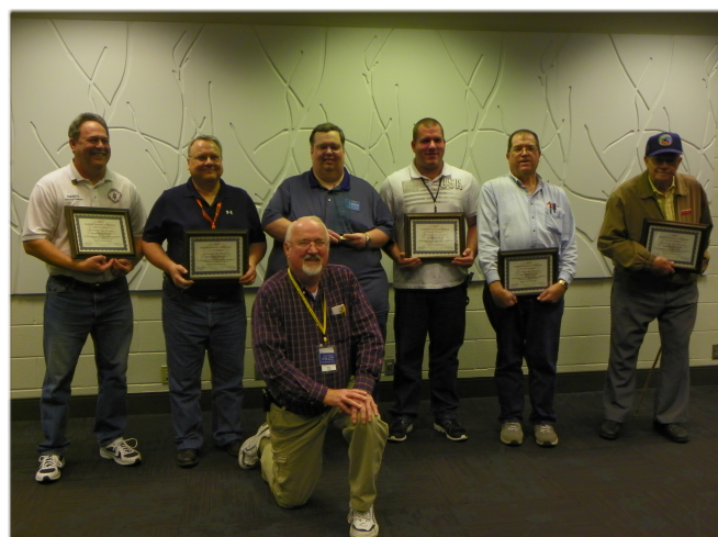
The 2013 IRCC Amateur of the Year Nominees with IRCC