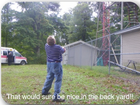
That would sure be nice in the back yard!!