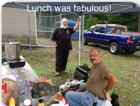
Lunch was fabulous!

All three aspects of the radio operations had been completed successfully. The sun finally came out for a brief time, and the view from the summit was awesome. A check of the radar indicated some approaching weather and the group decided to begin tear down. In just a short time everything was down and packed away. With everyone in the group satisfied that our objectives had been met, we began the convoy back home. The District 7 ARES team performed very well during this exercise. We put our deployment skills to the test, and we all were very pleased with what we accomplished. Without a doubt this team can capably deploy to a site and establish radio communications. We have an awesome ARES team in Indiana District 7.