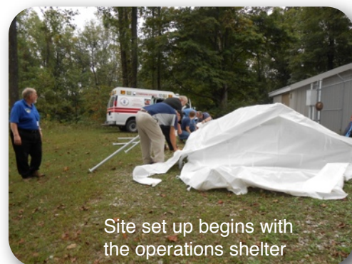
Site set up begins with the operations shelter