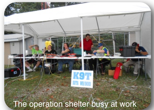
The operation shelter busy at work

Three stations were operating the special event K9T. We chose to operate on 80, 40 and 20 meters for the time we had on the air. Two interesting things happened during our special event operation. As mentioned, our special event was commemorating the anniversary of Shawnee Chief Tecumseh's death in the Battle of Thames. One of the stations that returned our call was from Canada, and was with a group that was conducting a reenactment of the Battle. The second was a call from a station in Kentucky that was part of the Kentucky District 7 ARES team, which was also conducting an exercise.