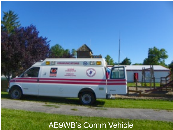
AB9WB's Comm Vehicle