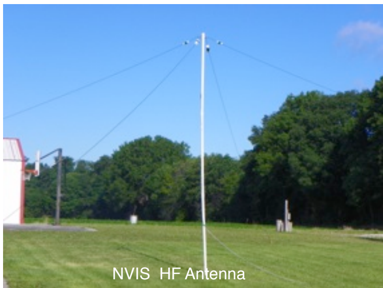
NVIS HF Antenna