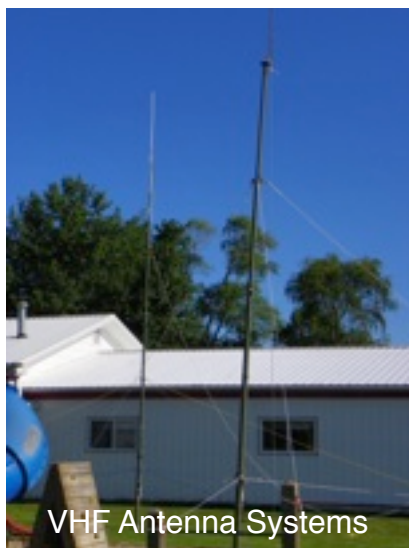
VHF Antenna Systems