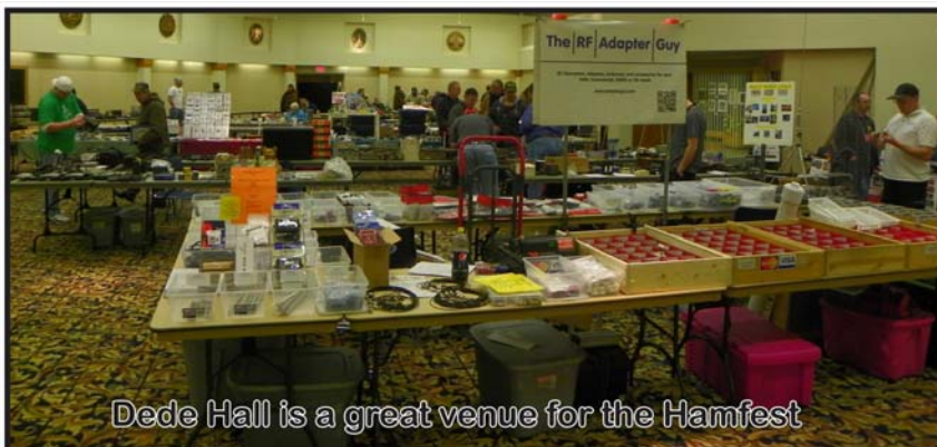
Dede Hall is a great venue for the Hamfest

The WVARA would like to thank all of those that made our hamfest a success this year.