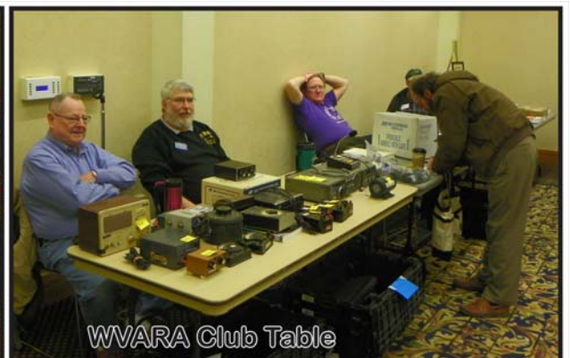
WVARA Club Table