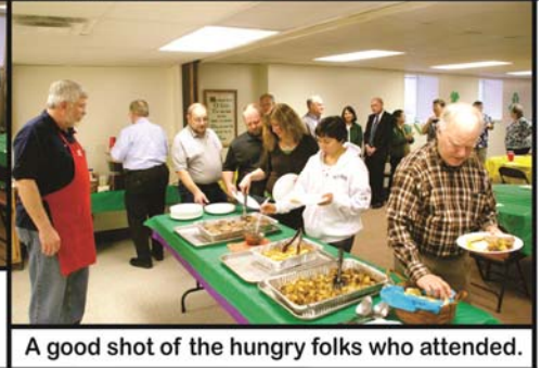
A good shot of the hungry folks who attended.