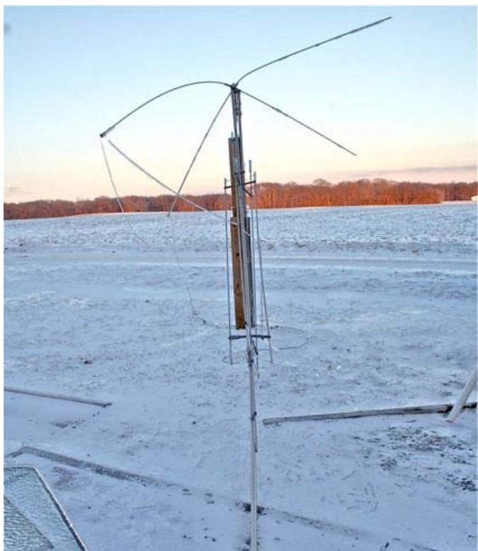
What's left of Nick's GAP after the ice worked on it.