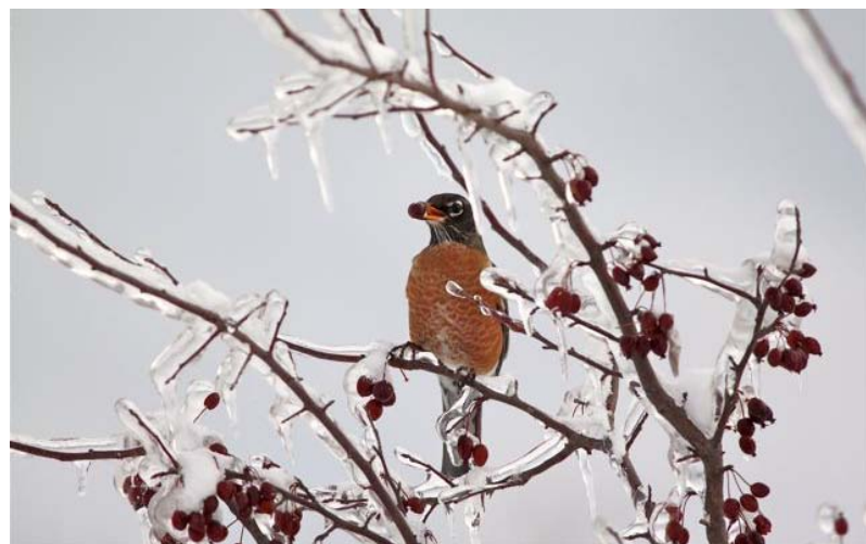
‘This is ridiculous! Think I'm going to fly south again!’