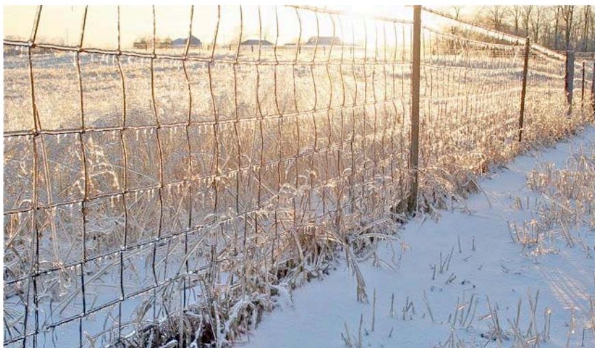
Fence near Nick's.