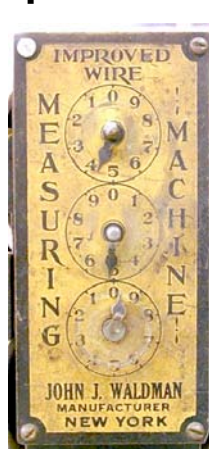
It should be firmly understood that we only use the latest state-of-the-art equipment here!