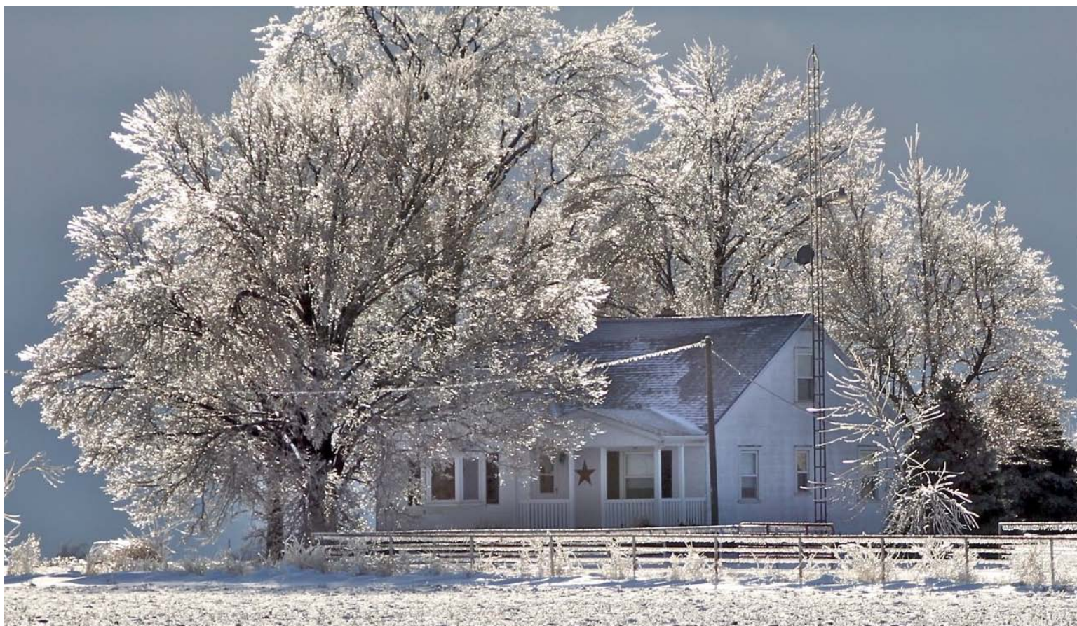
The worst ice storm to hit the Wabash Valley in many years brought the area to a virtual halt to begin February. (See pp. 3 and 4)