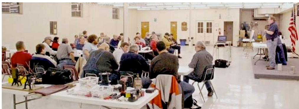
The Club meeting to build dipole antennas was postponed for a week but then went ahead successfully the following Friday. (See pp. 5 and 6)