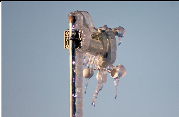
“My wind meter froze over pretty quickly.” - w9OZZ