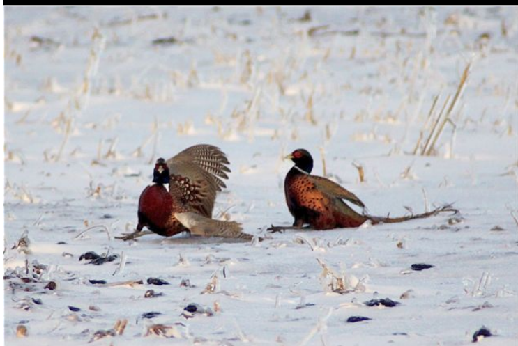
“Even the pheasants couldn't stand up very well while walking around on the ice.” - w9OZZ

“Even with all the damage an ice storm creates, there is always beauty and humor to be found.” - Kathy, W9OZZ