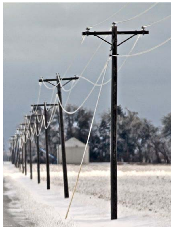
“What the power lines looked like down the road.” - w9OZZ