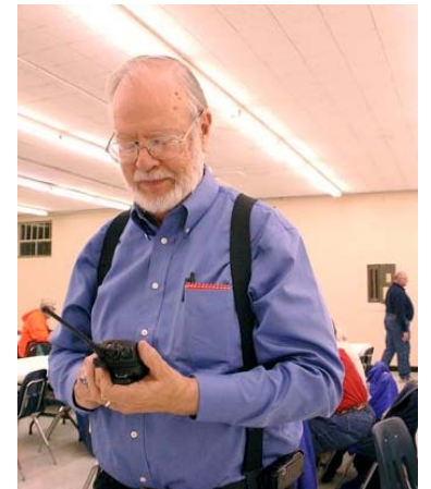
How did HE ever get in here?