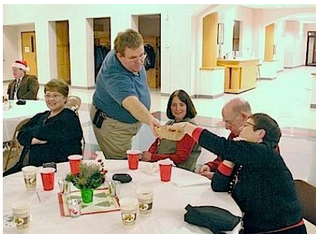
Then each participant draws one from the basket.