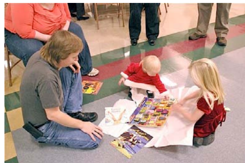
However, this present was 'frozen' to begin with.