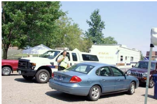
The EMA trailer, the only air-conditioned spot all day, finally arrives!!!