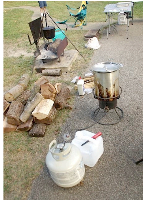
Steve's deep-frying setup.