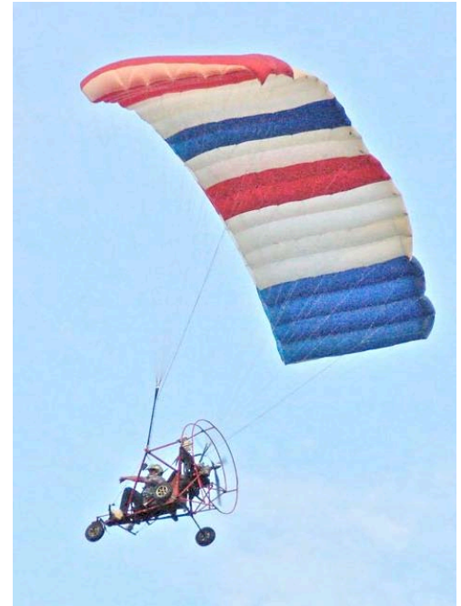
This gentleman made several very low passes over the campground, to our delight.