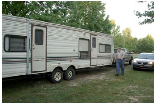
Kevin finally arrives just in time for dinner.