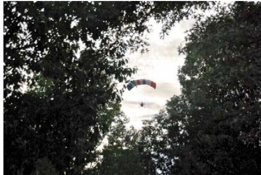
We heard him coming long before we could see him in his parasail machine.