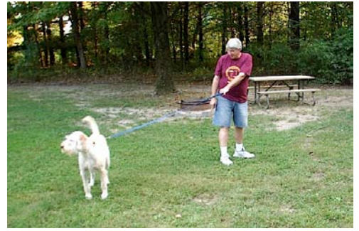
Seems like practically everybody had a dawg!