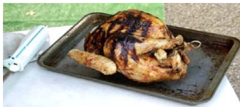
This was our first deep-fried turkey. Yum!