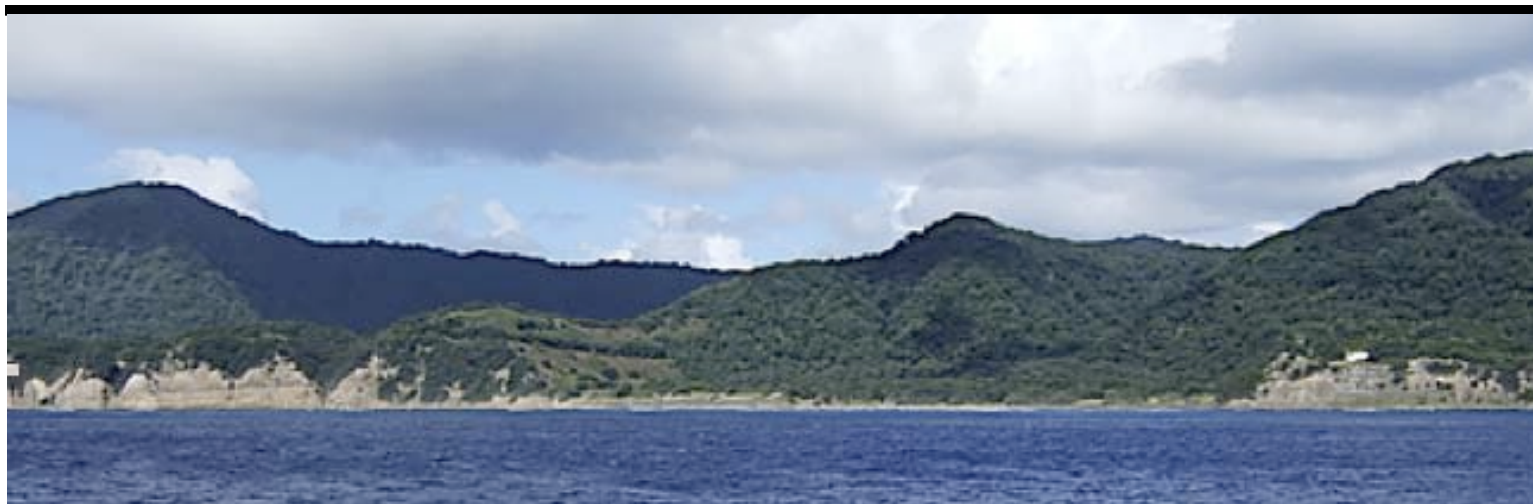
The Kermadec Island, ZL8R, DXpedition, came here to Raoul Island, 600 MILES NNE of New Zealand

There have been mammoth DXpeditions equipped with a good number of kilowatt stations and huge antennas making the news.