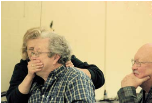
Don't you DARE bid on that "thing!"

Wives often accompany their husbands on Auction Night to cheer them on and show support for their effort to claim the prize!