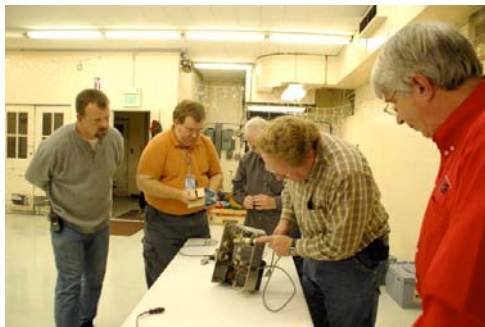
This is a bargain at any price... below 10 cents.