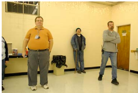
You really have to be on your toes to win the bid!