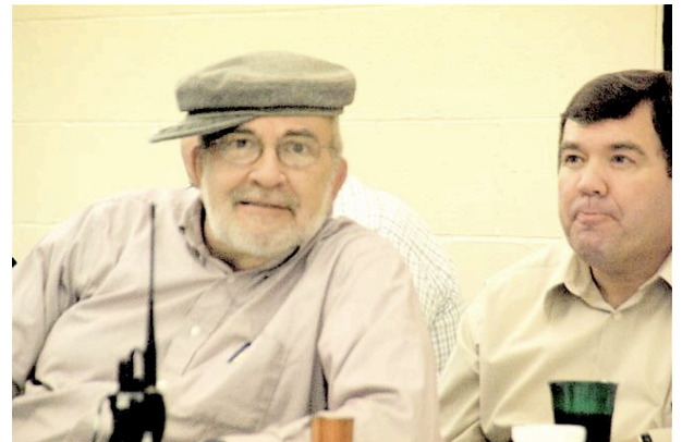
Our able and competent staff is here to serve your needs!