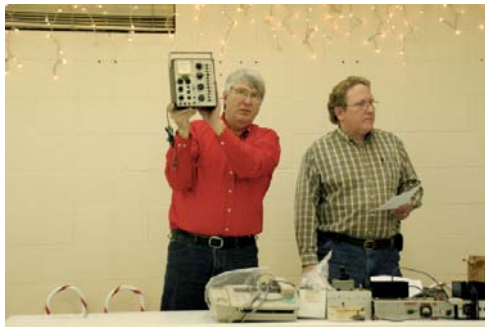
Everybody nowadays needs a tube checker!

The annual Junque Auction features electronic equipment comprised of the highest quality and sophistication found anywhere in the basements and garages of the Wabash Valley! "It worked the last time I turned it on," can be heard reverberating off the walls and ceiling on this special night!