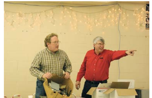
SOLD- to the man over there scratching his head!

The annual Junque Auction features electronic equipment comprised of the highest quality and sophistication found anywhere in the basements and garages of the Wabash Valley! "It worked the last time I turned it on," can be heard reverberating off the walls and ceiling on this special night!