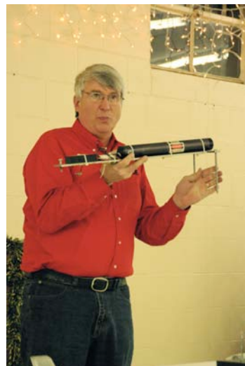
This little number is guaranteed to remove warts, moles or your pesky neighbor. NOT certified by Underwriters Laboratory!