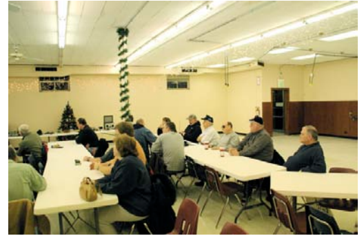
This is not exactly a panorama but you get the picture.