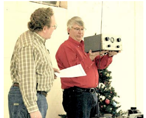
Let's see. Um... NICE NOBS!

Wives often accompany their husbands on Auction Night to cheer them on and show support for their effort to claim the prize!