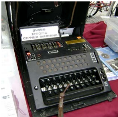
You're REALLY OLD if you ever used this.