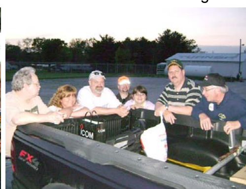
One last confab before the final trek home.