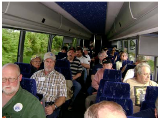
Time for a nap. Then it's Shapiro!