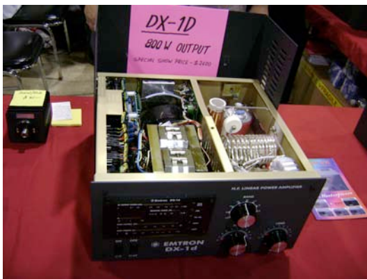
Lots and lots of goodies!