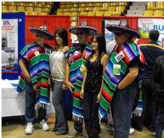
What are they selling? Who cares!

A BIG TNX to W9OOT, N9YRX and WB9ZHC for the Dayton Hamfest photos! -ed.