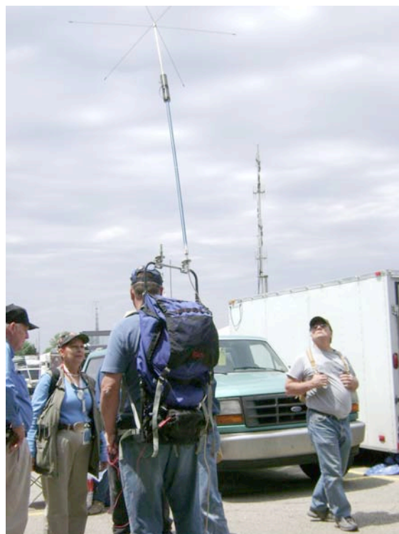
Now, THERE'S an HT with RANGE!