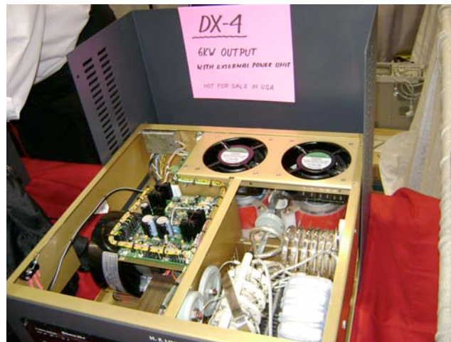
Can you read the fine print? "6KW... NOT FOR SALE IN THE USA" Uh huh. Right.