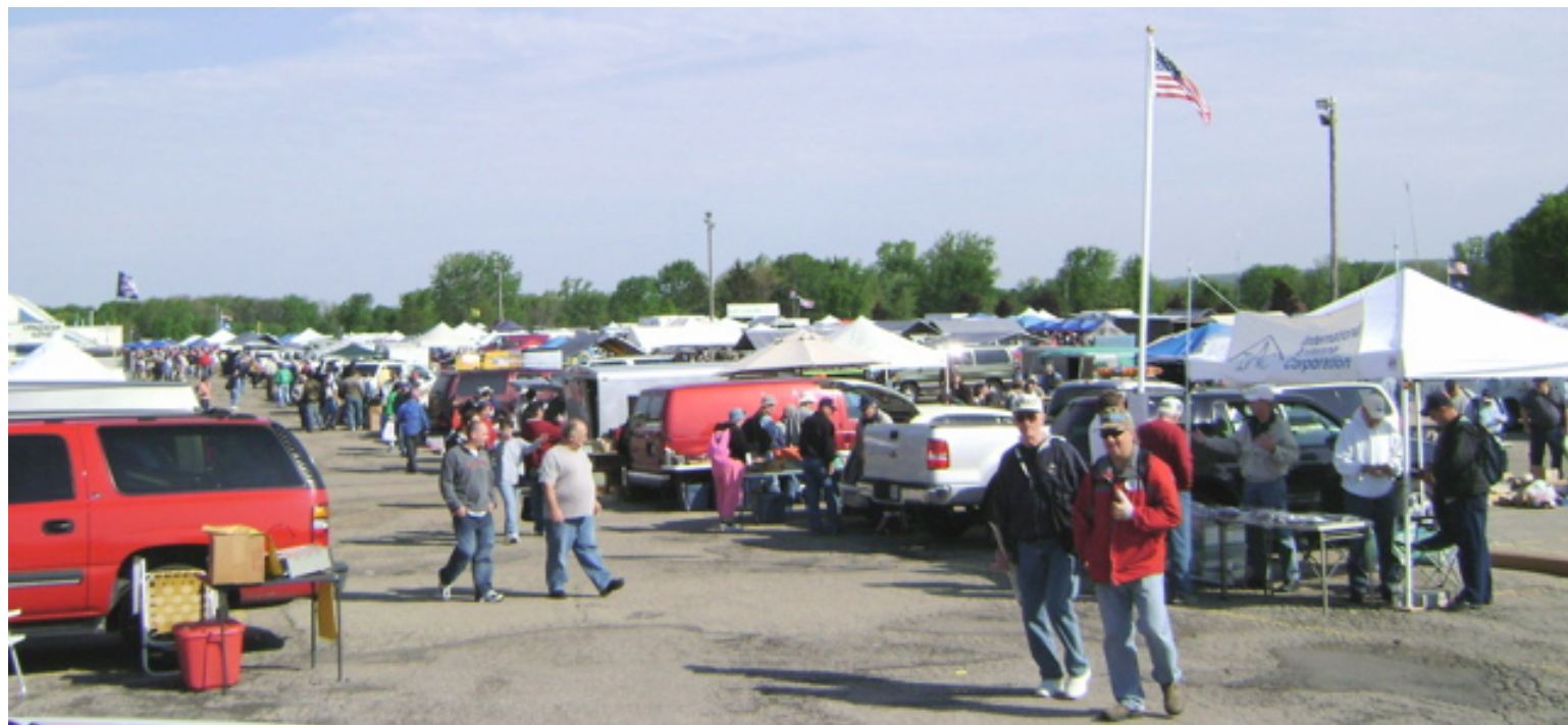
The fairways were as not as crowded this year.