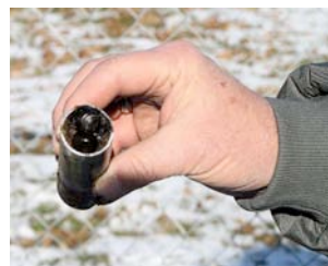
How'd they get in there?