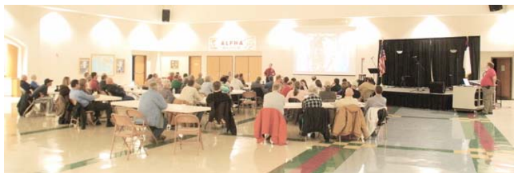
Over 60 hams and non-hams alike attended this year's spotters' class.