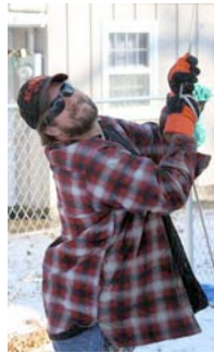
If I let go...