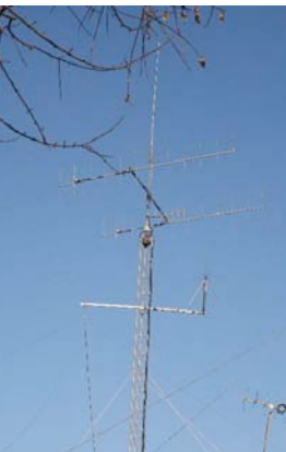
After - Well done, Jerry!