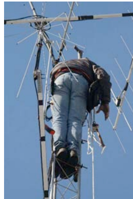
Maybe not Jerry's best profile