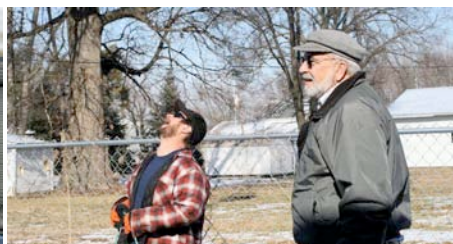
Ya gotta have good ground supervisors