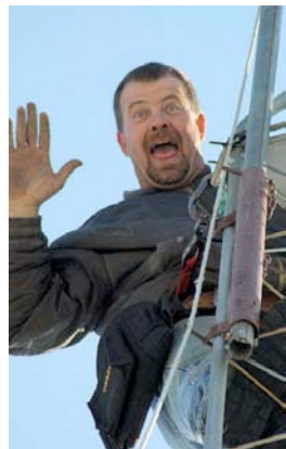
This may not be either