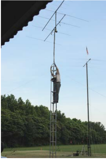
What, Wayne? No climbing belt?