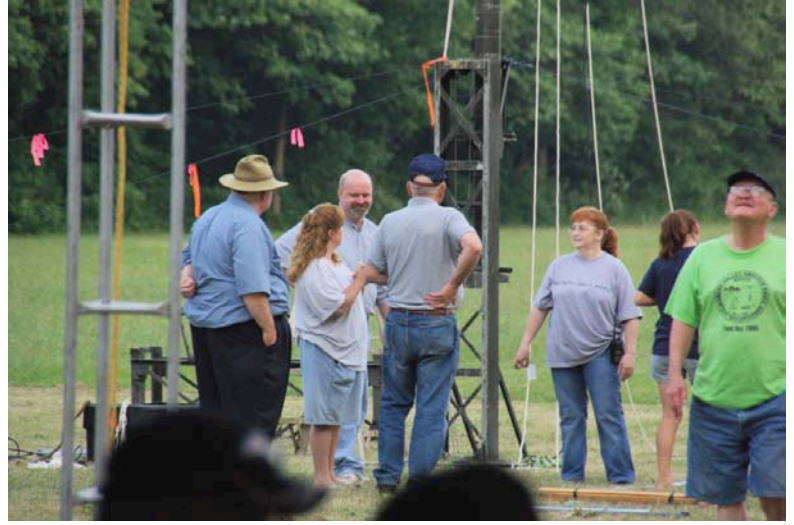
Are we working here or socializing - or is there a difference?