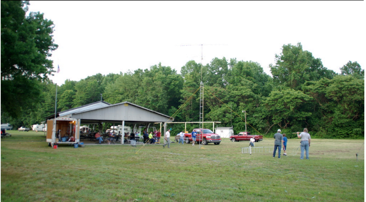
Friday night setup time finds a large number of volunteers turning out to help... and to eat, of course.