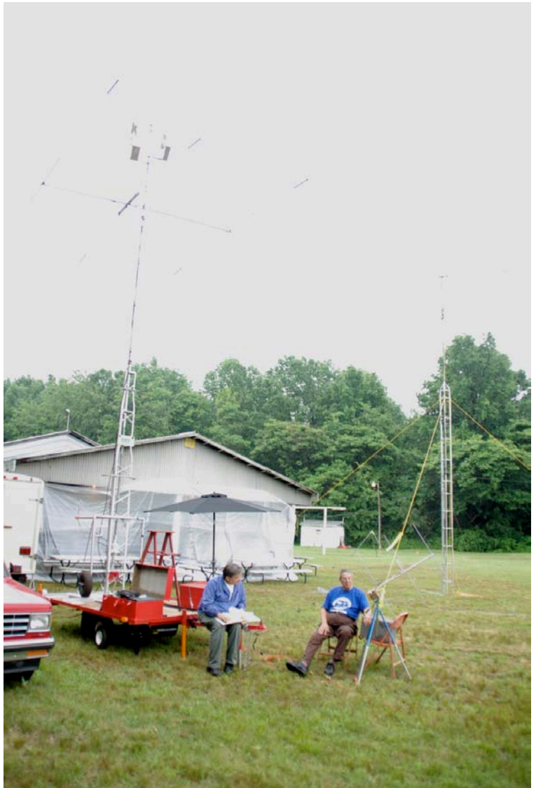
Jim, we'd like to know how that compact HF beam is doing on the air.