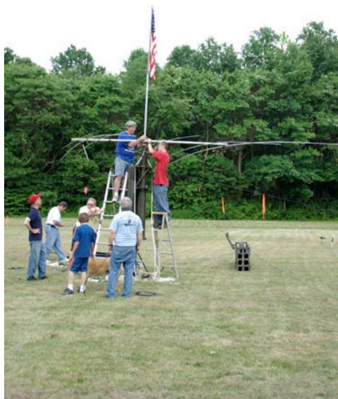
Field Day setup, Friday afternoon; more photos follow.

Field Day 07 is over; so when's the first Field Day 2008 planning meeting?