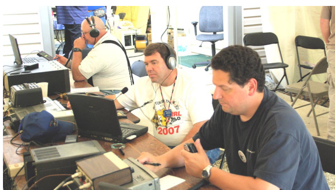
NT9T, W9EEU and KC9JSY - ops