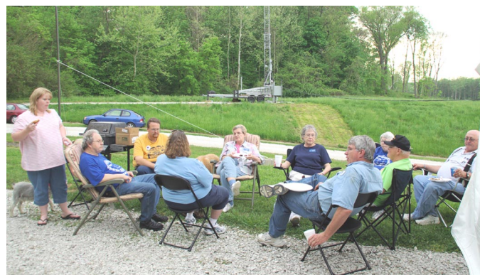
Some of the group eat and socialize outside.