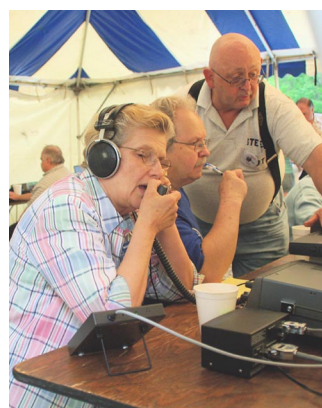
KC9GWT, AB9GI and NT9T - ops. Allison and W9COD - pbpbpb!