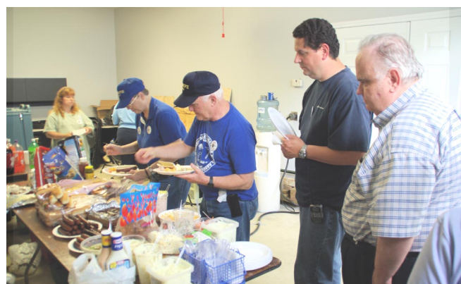
Doing what we do best!

Credit for photos are given where appropriate. The remainder are staff photos. -ed.