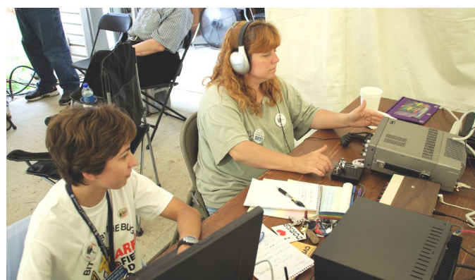
WD9EEU and WB9ZHC - ops.