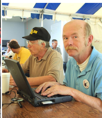
KC9LBN and N9FMD - ops.