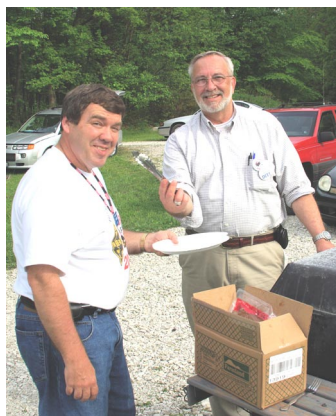
W9EEU & N9YRX - brat detail.