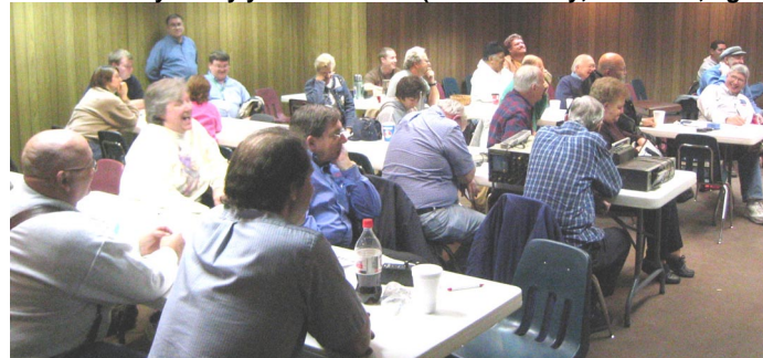
Some of the bunch who attended the yearly auction.