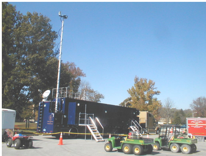
The State of Indiana Mobile Communications Center (MCC)

The entire operation was going to be based on 800 MHz Public Service bands using combinations of the State Wide frequencies and the NPSPAC channels. NPSPAC Direct channels worked fine (simplex) around most of the campus, but when anyone went into any of the 100 plus year old buildings of brick and stone they quickly became marginal. Any of the State talk groups were very rough to use. Standing around with an 800 MHz HT in your hand, on simplex, was great but if you were monitoring on State Wide Mutual Aid 2 which relied on the nearest tower about 10 miles away, one had to step outside in order to successfully hit the tower.