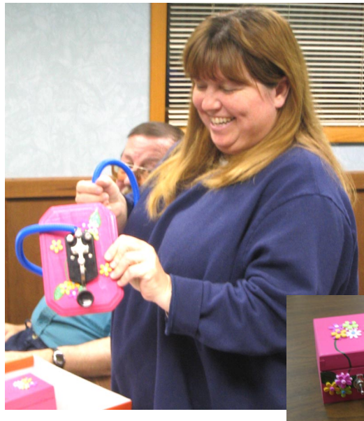
"Feminine" Code Practice Oscillator