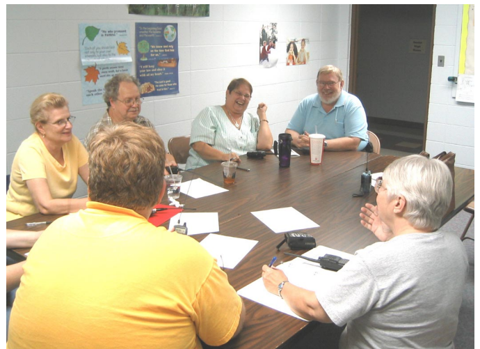
Finally, CAARLA sponsored a "How to become even more confused while learning to program your HT" night where we all learned... something?