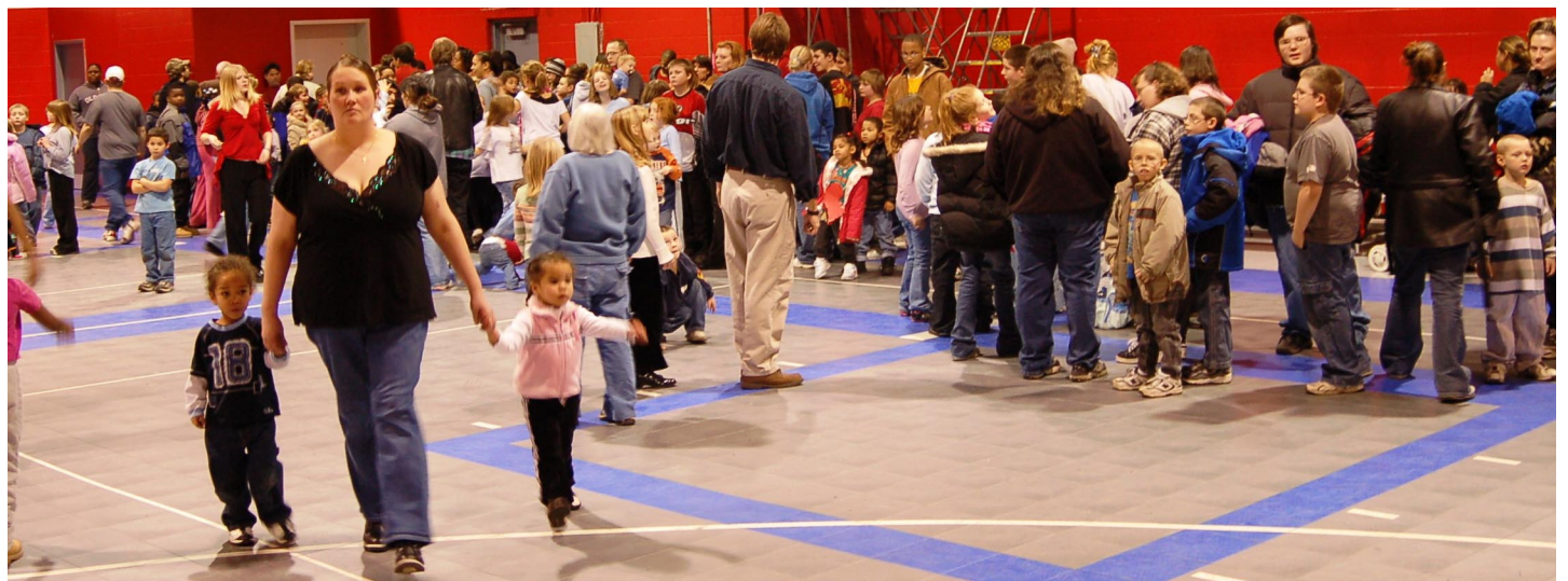
It takes a lot of communication to keep this anxious crowd in order.