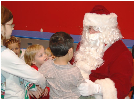
Santa looks a bit familiar.

Once again area hams came to the aid of the community.