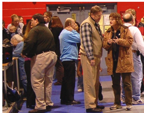
Who's in charge here?