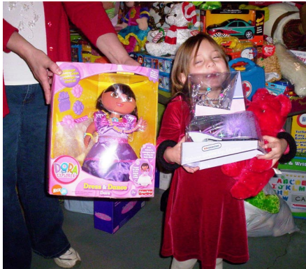
Somebody's really happy!