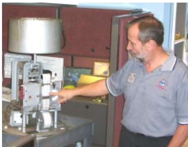
A remote rainfall measuring device used by NWS.