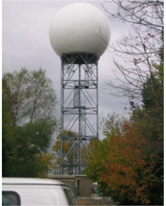
This is how the NWS gets its information. There is a radar dish inside the dome. This is the dome you see just south of interstate 70 as you pass Fed Ex terminal at the airport.