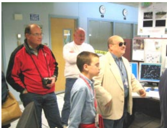
Touring the main weather service control facility.