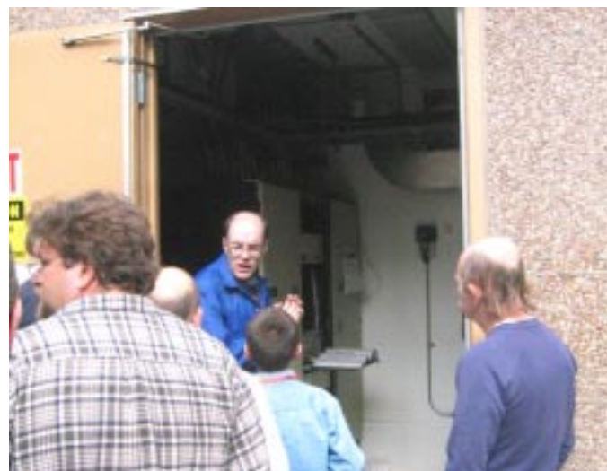
Now, don't touch ANYTHING in here! ( NexRad xmtr bldg )