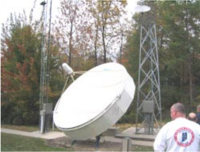
This is how we get the visual information from the NWS. This is the data uplink to satellite.