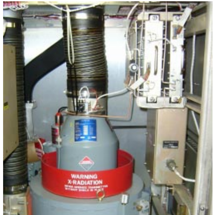
The NWS NEXRAD transmitter situated in a high-security building at the base of the radome.