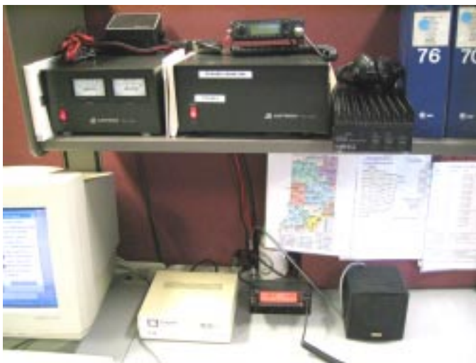
This is how we, here at Illiana Skywarn, thanks to the new 440 linking system, get our audio information - Amateur Radio Station W9NWS, located here inside the National Weather Service office.