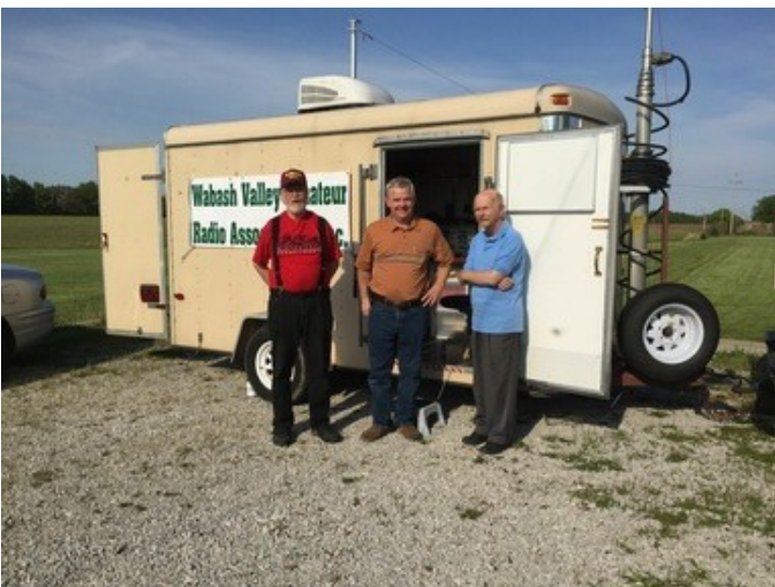
K9ERE, W9KJO, and N9FMD