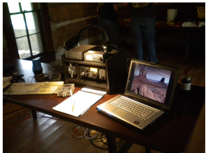
CW Station manned by N9TH