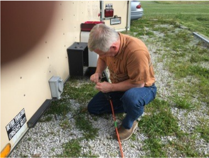
W9KJO rewires the 4-prong input plug