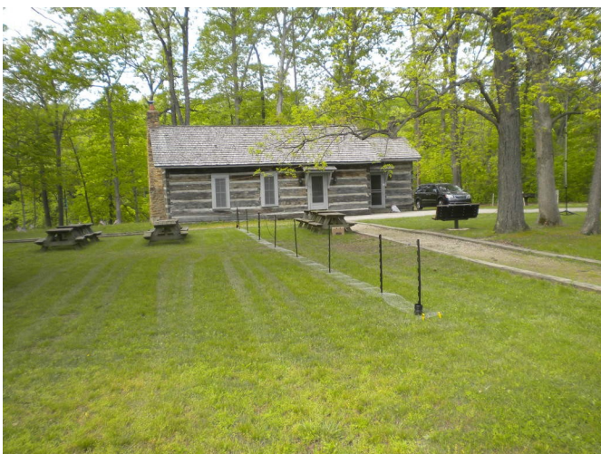
Log Cabin at Shakamak