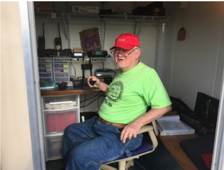
K9SGL at the ops