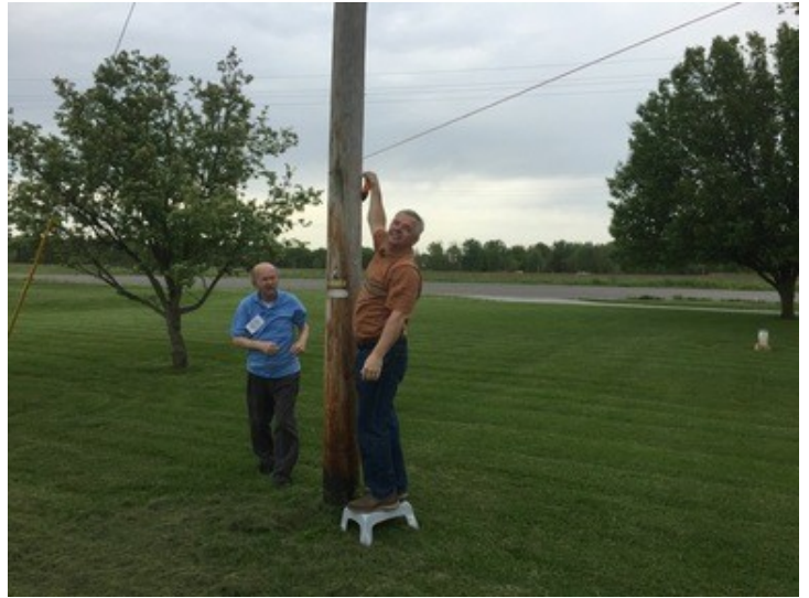
N9FMD and W9KJO erecting the 20M dipole