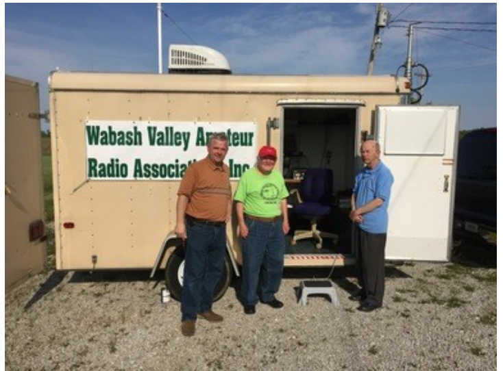
W9KJO, K9SGL, and N9FMD