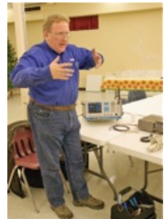
Photo credits from the January meeting"