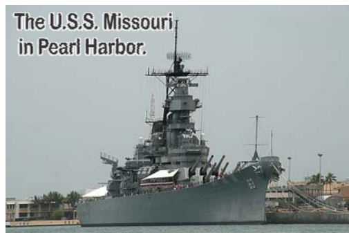
The U.S.S. Missouri in Pearl Harbor.