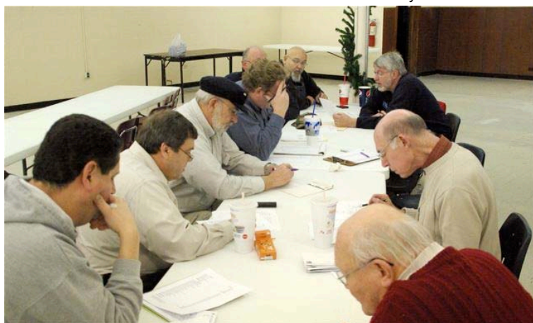
Board meetings are usually after the general meeting... except this time. Anyway, come join us. It's always lotsa laughs! Well, usually. -ed.