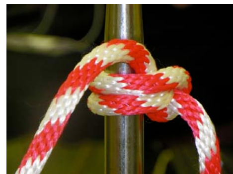
This one is a clove hitch.