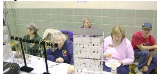
The ladies again sold electrical component Jewelry.