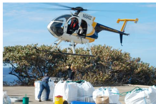
Helicopters ( here and lower left ) were the only means of supply.