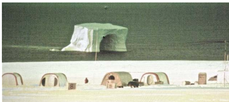
Camp plus 300 ft. floating iceberg slowly melting in the bay.