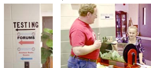
We regret that we didn't get the name of the young lady who helped with the prize ticket drawings. Anyone know?