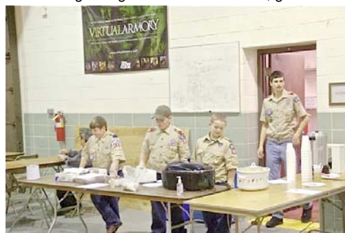
The Boy Scouts helped out again this year by preparing and selling breakfast and lunch.