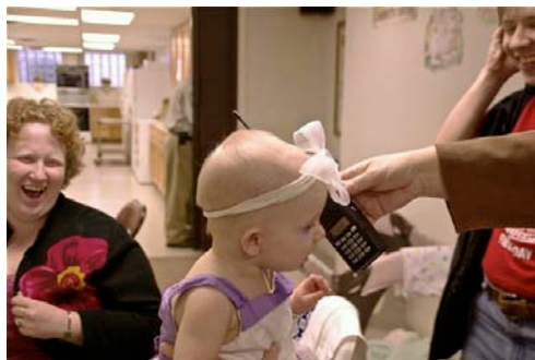
It's never too early to get them started!