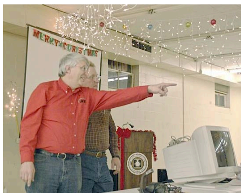
Don't anyone scratch your nose or you'll own something!

So, many 'treasures' traded residences and so many extremely high bids filled the air, that some items even went for more than a dollar!