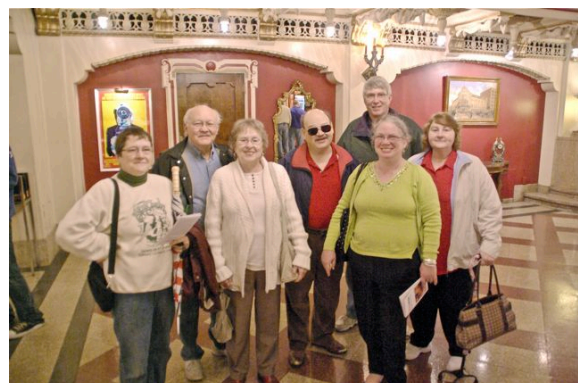
The loyal peanut gallery. They also serve who sit and watch (or something like that).