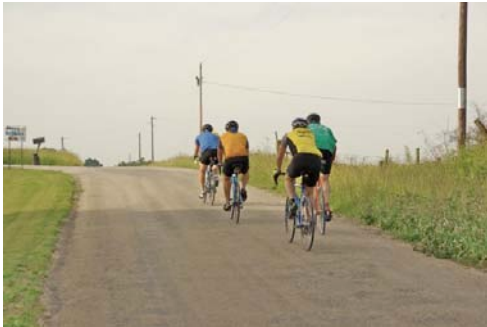
There they go!

Our stations commented that the bikers were very appreciative of our effort, thanking us for being there as they rode past our locations. That kinda makes it worth while right there!