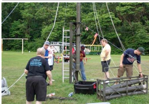
Up goes the "portable" tower.