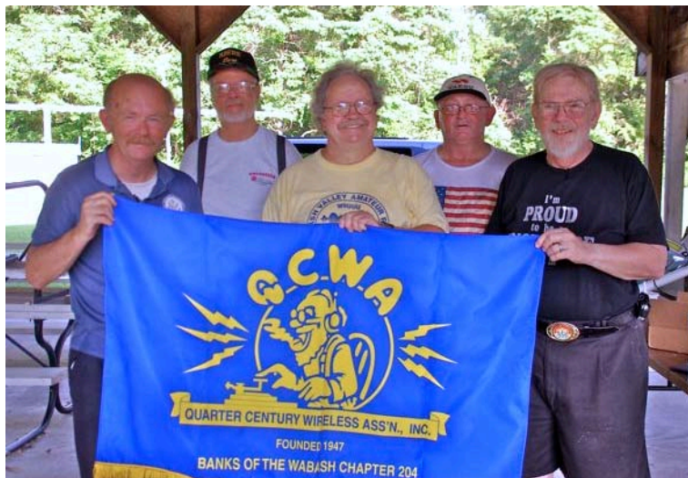
A group of QCWA members at Field Day unveil the new Chapter 204 flag.

-Respectfully Submitted, Bette Young, KC9GWT, Secretary.