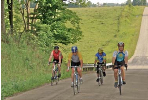
Here they come!