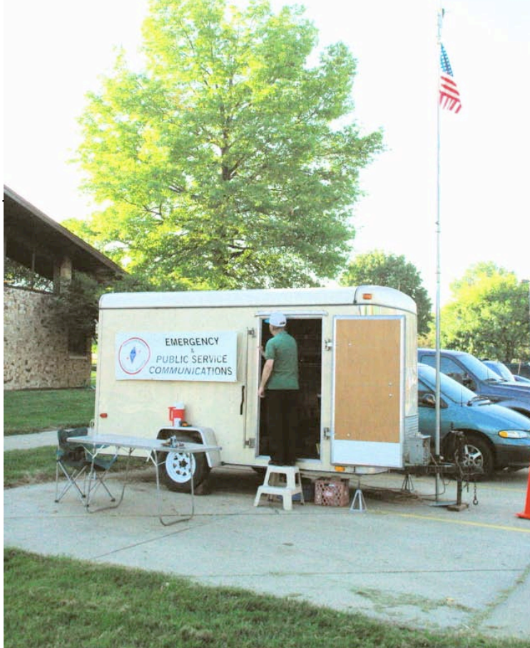
Our usual spot on the parking lot at the Vigo Co. Library.