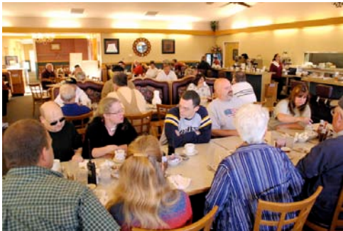
Planning session at the Valley Gril.