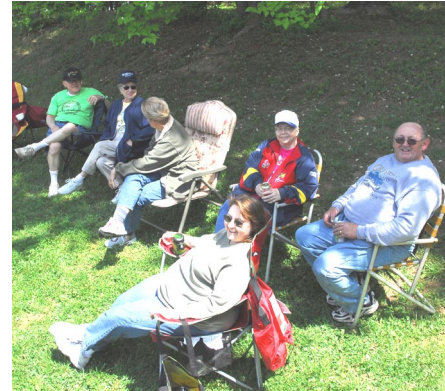
Don't try this at home. It requires extensive training and practice! (Classes available.)