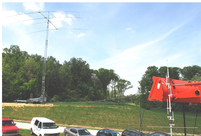
You'll probably see it again at Field Day... if you're there!