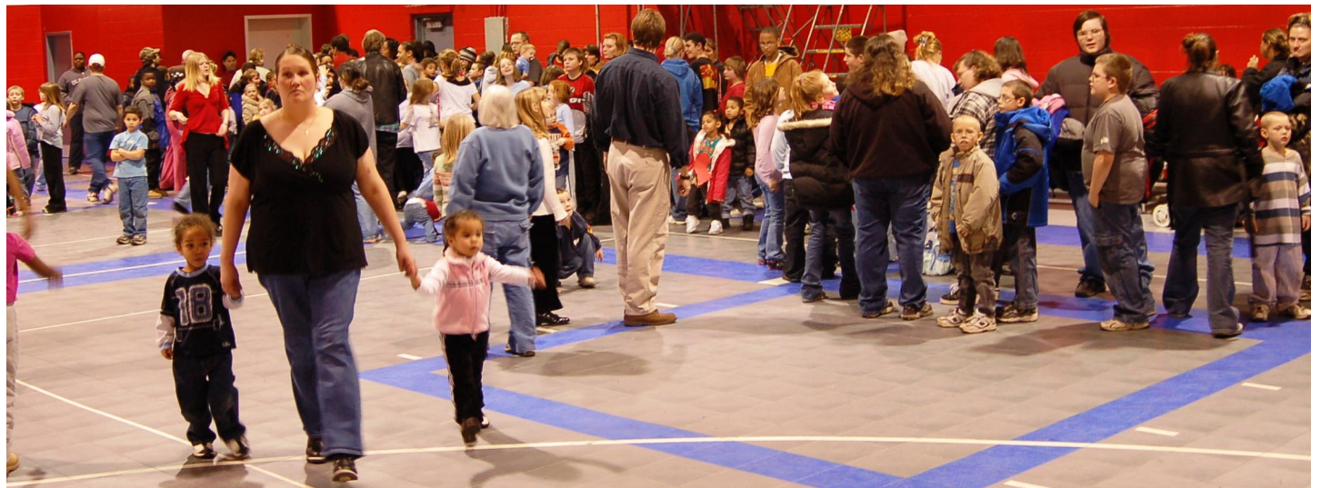
It takes a lot of communication to keep this anxious crowd in order.