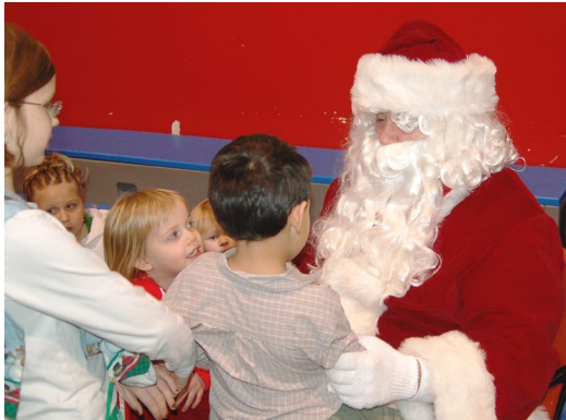
Santa looks a bit familiar.

Once again area hams came to the aid of the community.