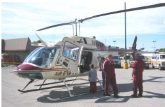
Daddy, please buy me one of these!!! (Local air evac chopper)

If you normally read your Bandspread backwards, see p. 1