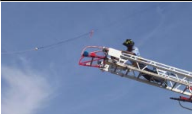
The Fire Department checks our HF antenna.