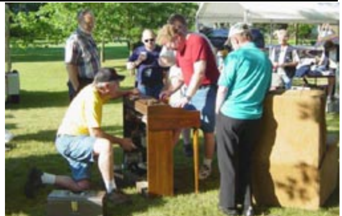
Now, if we can just keep it running long enough...