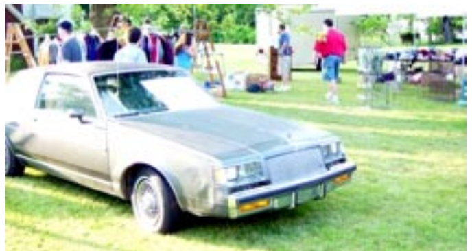
Silent Auction Car