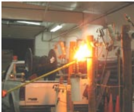
Here's what happens when a grounded object gets too near a high-voltage line!

There was plenty of voltage and fire and we got the maximum 'bang' for our buck this time!