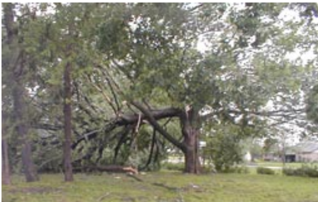
Straight-line winds probably did this.

Here is a collection of pictures from the recent storm and another from Dayton.