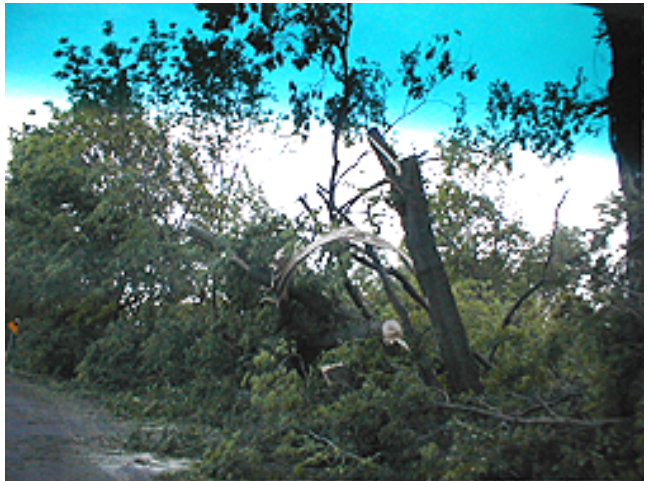
Trees here were twisted and topped along the road.

Here is a collection of pictures from the recent storm and another from Dayton.