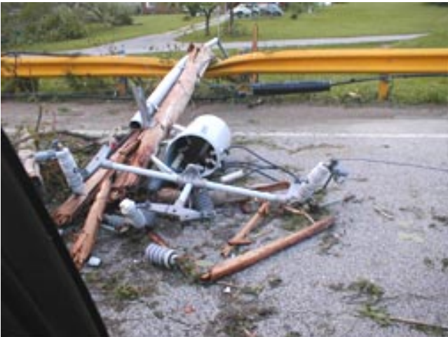
A power pole was destroyed here.