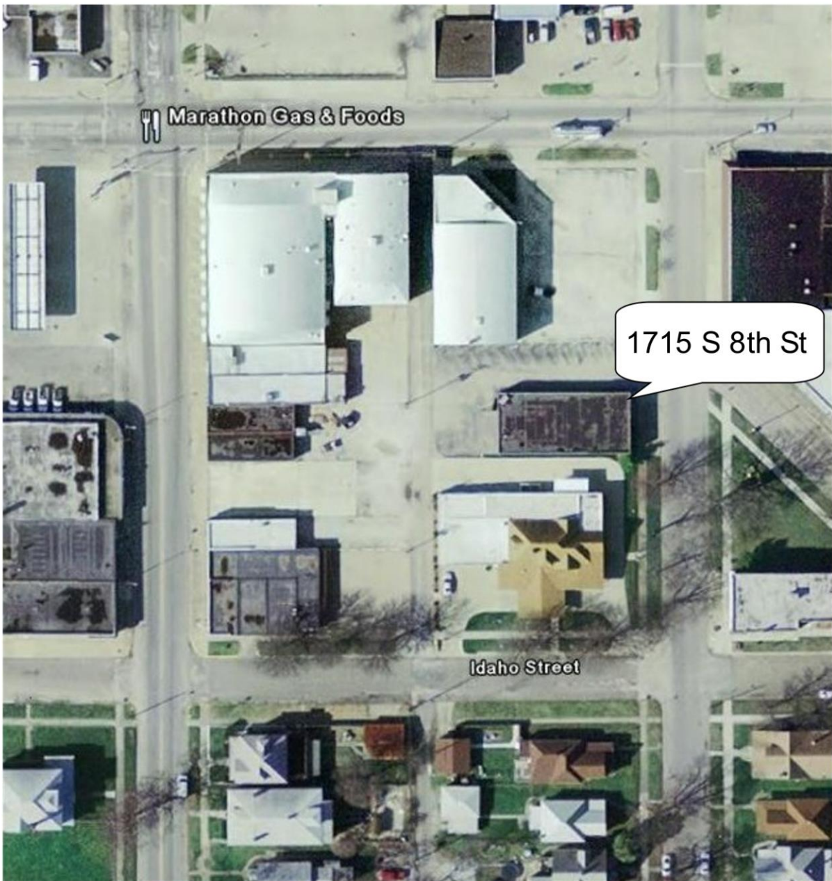
Aerial View of Glas-Col Property Showing Location of Entrance to Building